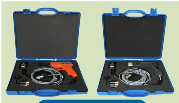
P1123 Carrying case for Electronic Start System, compatible for both Club or Pro system (shown products not included)

Tip: You can mount on starters stand, starter stand not included