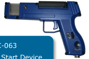
TTC-063 Electronics Start Device