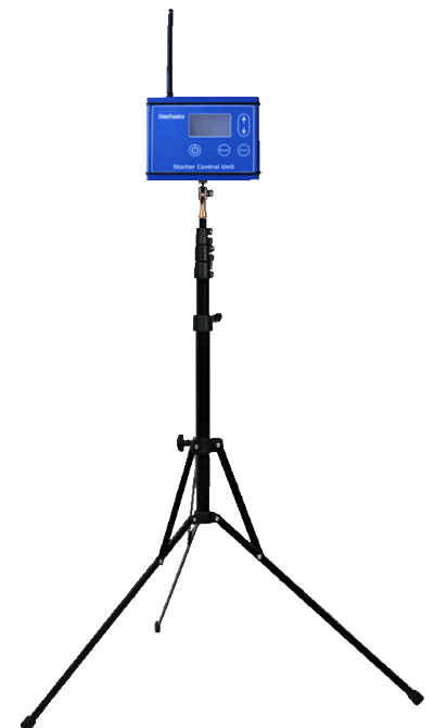
TTP-1225 + TTP-075 Starter Central Unit + Tripod