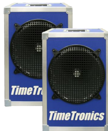
TTP-1130 Optional Additional Speaker (Which can be placed closer to the athletes, e.g. one in lane 3 and one in lane 6)