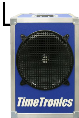
TTP-1226 Trolley Speakerbox